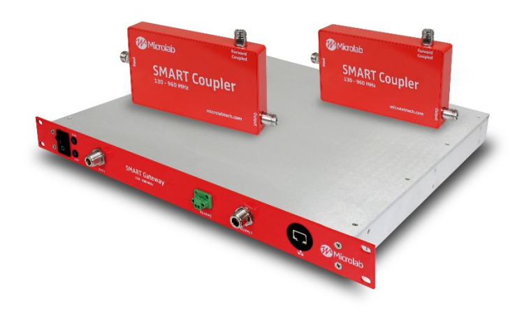
Figure 1: The Microlab SMART Passives System, featuring the SMART Gateway and a pair of SMART Couplers.

A public safety, emergency responder radio communications system (ERRCS) DAS must consistently deliver reliable performance to provide high-quality communications and radio coverage to first responders amid an emergency. Due to their tactical nature, emergency communications systems must satisfy rigid RF signal coverage (RSSI) and delivered audio quality (DAQ) requirements, such as maintaining 99% radio coverage in mission-critical areas of a building and greater than 90% radio coverage across all floors in general areas. However, it can be a year or more between proof-of-performance, floor-by-floor, walk-through grid tests, which are used to validate the operation of these critical communications systems. The Microlab SMART Passives System eliminates the uncertainty surrounding the overall integrity of a public safety DAS and radio performance with real-time monitoring of DAS cabling, RF components, and antennas deep into a building (Figure 1). Comprised of a SMART Gateway at the head-end and a network of SMART Couplers, the SMART Passives System and its real-time diagnostics capabilities will ensure the integrity of critical DAS infrastructure by continuously monitoring for catastrophic failures (open or short circuits) or properly terminated antennas and cables.