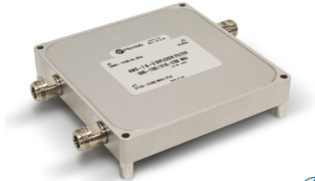
AWS Duplexer BL-51N