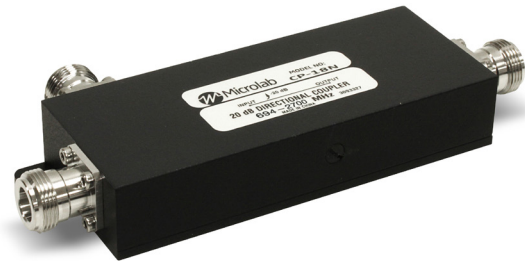
Similar Model CP-18N shown

The CP-10E series of Directional Couplers is a tapered stripline design covering from 694 to 2,700 MHz. Units couple off a defined fraction of signal with minimal reflections or loss. Availability in a wide range of coupling values makes this series useful in optimizing the power distribution required in passive in-building distributed antenna systems (DAS).