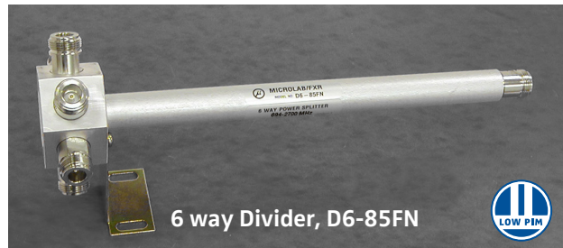
Six Way Outline